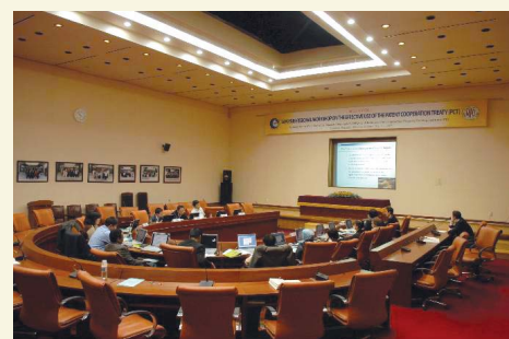
WIPO regional workshop at the IIPTI

The Korea-Japan Patent Prosecution Highway was inaugurated on April 1, 2007. With regard to the Japan Patent Office, the 19th Commissioners Meeting was held at Daejeon on November 27, 2007. The commissioners agreed to continue