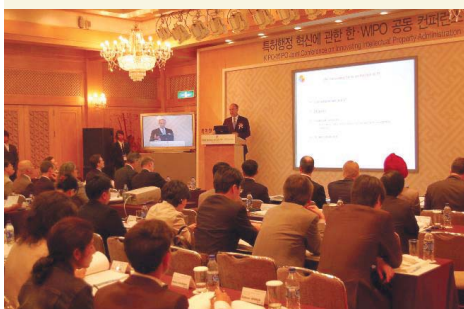
The 2007 KIPO-WIPO Joint Conference on Innovating IP Administration

A WIPO delegation, headed by Director General Kamil Idris, visited Korea on March 15, 2006, to acknowledge the country's contribution over the past 20 years to IPR education in developing and underdeveloped countries. During the visit, the International Intellectual Property Training Institute (IIPTI) was designated as the first WIPO partner international IP training institute.