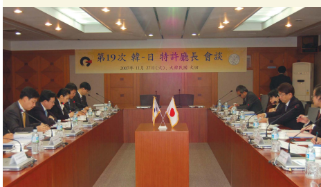
The 19 th commissioners meeting with the Japan Patent Office

exchanging statistical information on applications by using the Patent Prosecution Highway and to more actively promote joint prior art searches. They also discussed the possibility of having a joint conference of field experts, as well as IPR protection measures and international cooperation.