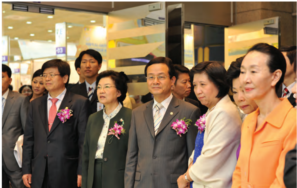
I Korea international women's invention exposition

The purpose of the exposition was to foster cooperation among women inventors from around the world, to facilitate information exchange among business people, and to expand opportunities for promoting the ideas of women inventors. The Korea International Women's Invention Exposition, which is held in conjunction with the Korea Women's Invention Fair and the Korea International Women's Invention Forum, is emerging as the largest festival of its kind in the world.