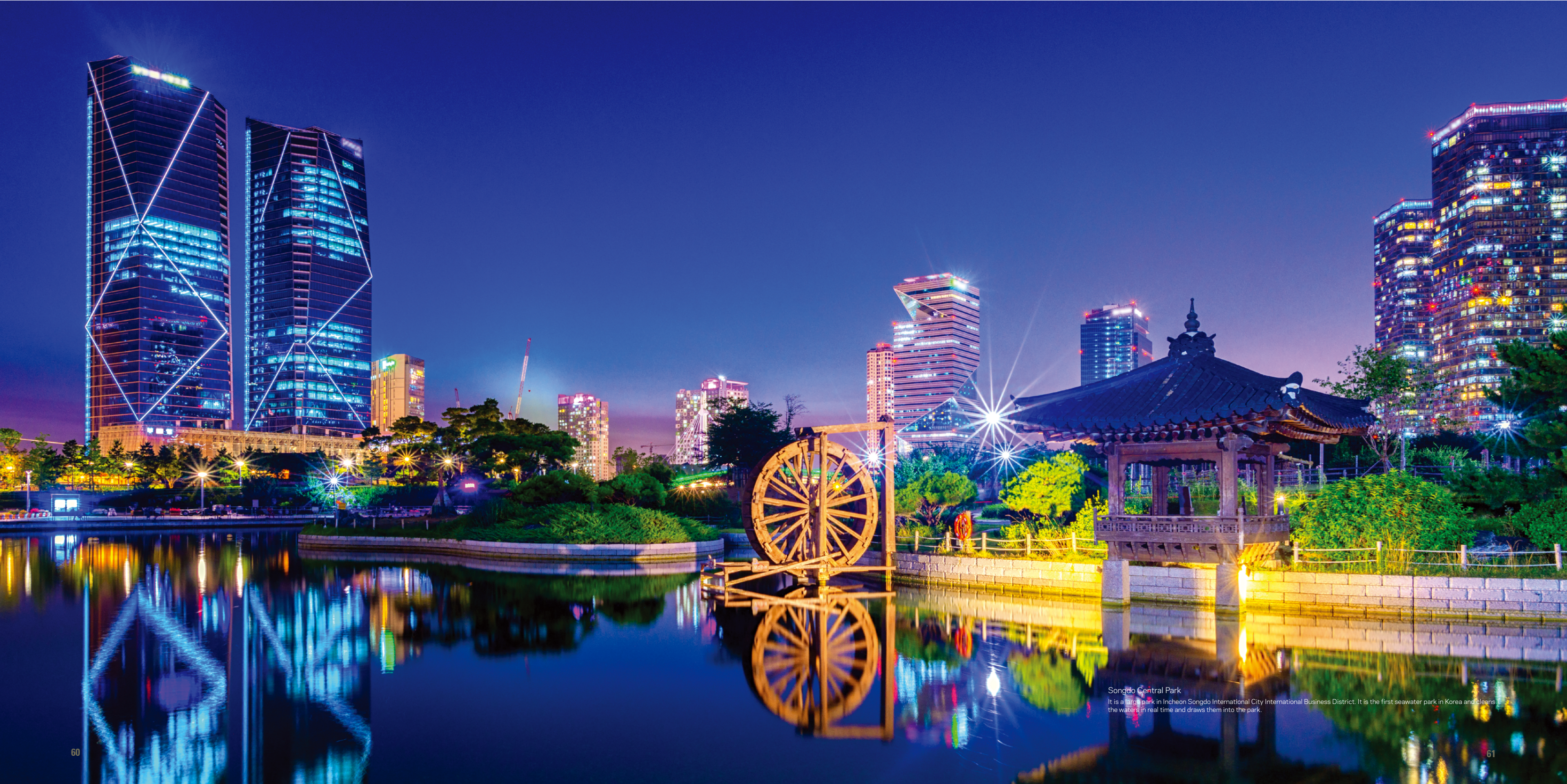
Songdo Central Park It is a large park in Incheon Songdo International City International Business District. It is the first seawater park in Korea and cleans the waters in real time and draws them into the park.